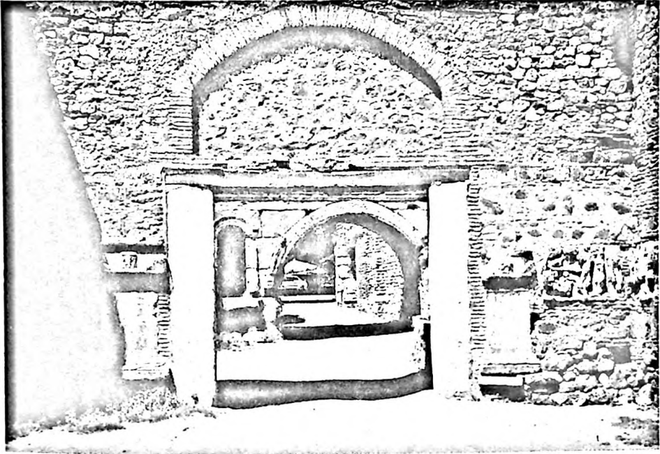
A city gate in Nicea, now in ruins.

views—especially Arhanasius— Christ has achieved our salvation because in him God has entered human history and opened the way for our return to him. Apparently Arius and his followers felt that Christ's role as Savior was imperiled by such a view, for Jesus had opened the way for salvation by his obedience to God, and such obedience would be meaningless if he himself was divine, and not a creature.