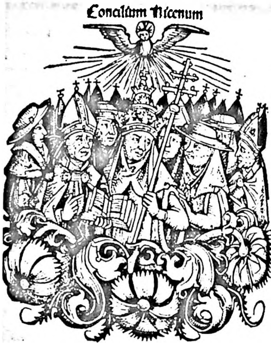
The Council of Nicea as depicted in the Nuremberg Chronicle.

the Father. Furthermore, in the last paragraph, those are condemned who declare that the Son “came from that which is not”—that is, out of nothing, like the rest of creation. Also, in the text of the creed itself, we are told that the Son was begotten “from the substance of the Father.”